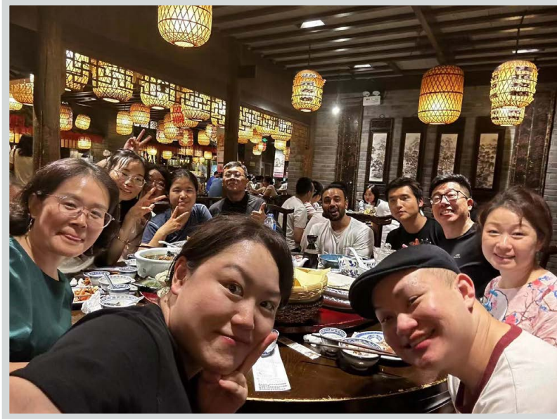
Members of the International Improv Toastmasters Club often gather after their meetings.

This club chartered in 2013 with a specific emphasis on improv training—and met in person for years before they became online-only during the pandemic. The shift drew new members from around the world.