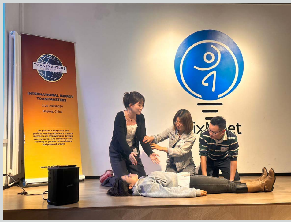
The International Improv Toastmasters Club in Beijing includes time in its meetings for playing improv games.

“I encourage people to view this as a golden ticket out of their comfort zones and a gateway to uncharted growth.”